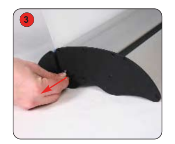
Whilst holding the graphic, remove the locking pin from the base and gently allow the graphic to retract.

WARNING: Always attach graphic to base and top rail before removing the locking pin.