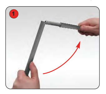
Open up the bungee pole until all 3 parts are fitted securely together.