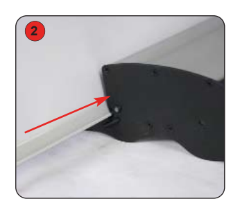
Slide the insert and graphic into the base.