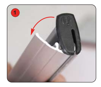
Open up snap rail as shown.