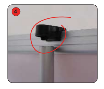
Fit pole into the top rail fixing.

Important: Hold the top rail whilst lowering the banner to prevent damage to the graphic. (do not drop)