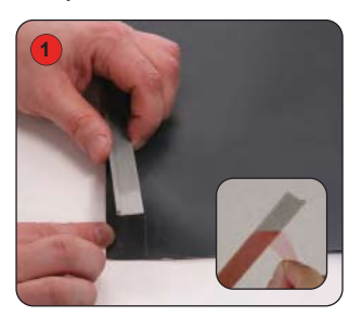
Adhere the insert to the back of the graphic.