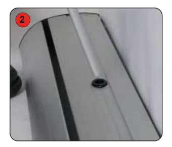
Slot the pole into the hole on the base and push down to secure fit.