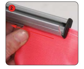
Slide the graphic through the end opening and move down until entire graphic edge is inserted