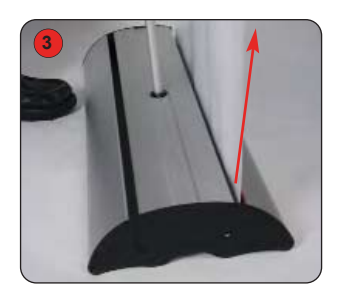
Pull graphic out of unit and tilt back to reach the top of the pole.