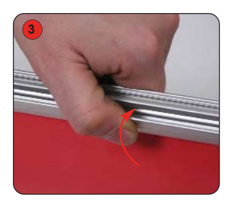
Close rail firmly onto graphic so it is fitted securely.